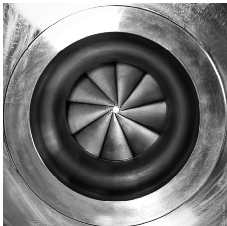
IGV blades at the inlet of a compressor pre-swirl gas flow entering the impeller, which reduces the amount of work needed from the main driver.

IGVs are a series of blades arranged at the inlet of a centrifugal compressor. Pneumatically driven IGVs pre-swirl the gas flow entering the impeller. As a result, turndown is increased while reducing the amount of work needed from the main driver.