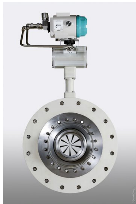
If process conditions change, the compressor's control system uses an actuator to open and close the IGV to keep the compressor within its best operating range.

IGVs have long been considered a requirement for high-flow applications such as reactor feeds, gas boosting for power generation, or overhead boost in gas treatments for LNG applications. They are now standard on new equipment. But given the 20- to 30-year lifespan of centrifugal compressors, there are thousands of machines running in refineries that could implement this upgrade.